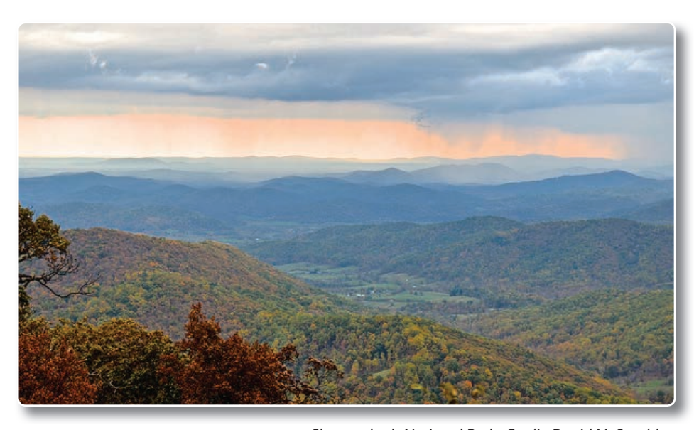
Shenandoah National Park.

ear after year, regions across the U.S. and around the world continue to report record temperatures, extreme weather events, and dramatic shifts in precipitation resulting in droughts in some areas and flooding in others. Based on the best available science and recorded observations, this continuing trend is expected to accelerate as the century moves forward. Along with current environmental, economic, and social changes that are influencing the landscape, climate change will augment these developments, affecting habitats and species in different ways. Understanding the potential risk and vulnerability of species and habitats to climate change within the Appalachians - a region rich in unique biodiversity found nowhere else on the planet with nearly 200 federally listed threatened or endangered species- is of critical importance and thus a major research priority for the Appalachian LCC.