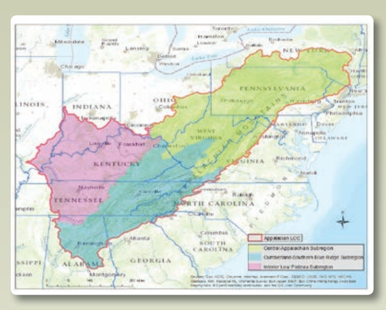
Division of the Appalachian LCC into ecologically consistent subregions used for vulnerability assessments.

Acquiring vulnerability information to large-scale impacts is vital for informing adaptation and mitigation efforts trying to sustain key Appalachian species and habitats.