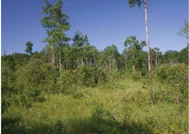
Figure 2. Burn regeneration in aspen woods. Note forest edge, dense shrubs, and some open areas with forbs. Tall trees within openings provide excellent song perches.

The key to productive Golden-winged Warbler habitat in this region is maintaining a forested mosaic that includes gaps with shrubs and forbs (Figure 2), whether or not these are fixed in position or shift over time. Forest edges should be "feathered", i.e., not with sharp transitions but irregular and with shrubs and forbs mixed with trees (Figure 3). Linear features such as trails with soft edges can produce Golden-winged Warbler habitat if human use is not excessive. Evidence suggests that Golden-winged Warblers will not occupy patches of apparent breeding habitat when agriculture constitutes > 30% of the surrounding landscape.