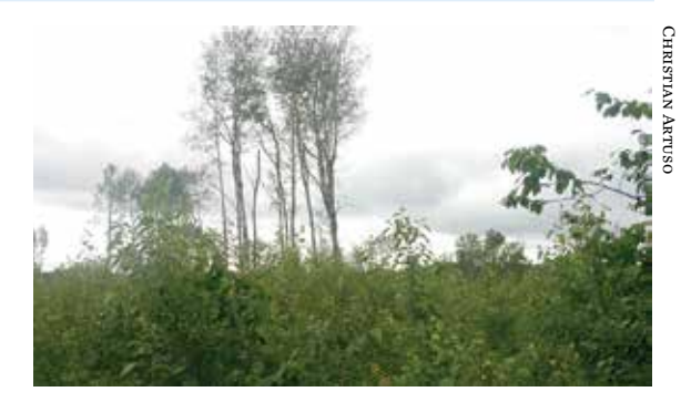
Figure 3. Leaving legacy trees and feathered edges in cutovers, greatly increases the likelihood Golden-winged Warblers will use a site after sufficient shrub regeneration, as long as the distance to the nearest forest edge is not too great (< 75 m or 245 ft).