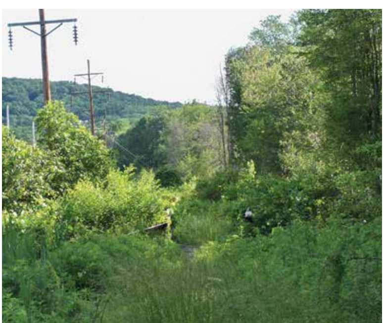
Figure 2. Narrow ROW adjacent to early successional habitat.

• Invasive plant species are often prevalent in utility ROWs, particularly Phragmites spp., reed canarygrass ( Phalaris arundinacea ), honeysuckles ( Lonicera spp.), oleasters ( Elaeagnus spp.), spotted knapweed ( Centau rea stoebe ) and common buckthorn ( Rhamnus cathar tica ). Eradication of invasive plants is recommended when possible.