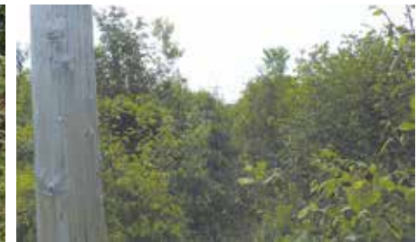
Figure 4. ROW with maximum shrub cover for Golden-winged Warbler.

Table 1. Suggested low woody plant species for Golden-winged Warbler in ROWs.