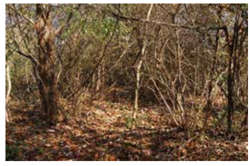
Figure 3. Examples of Golden-winged Warbler habitat (left and center photos) with a mix of residual trees, saplings, shrubs, and herbaceous cover and a harvested stand (right photo) where sapling regeneration has advanced beyond what is used by breeding Golden-winged Warblers.