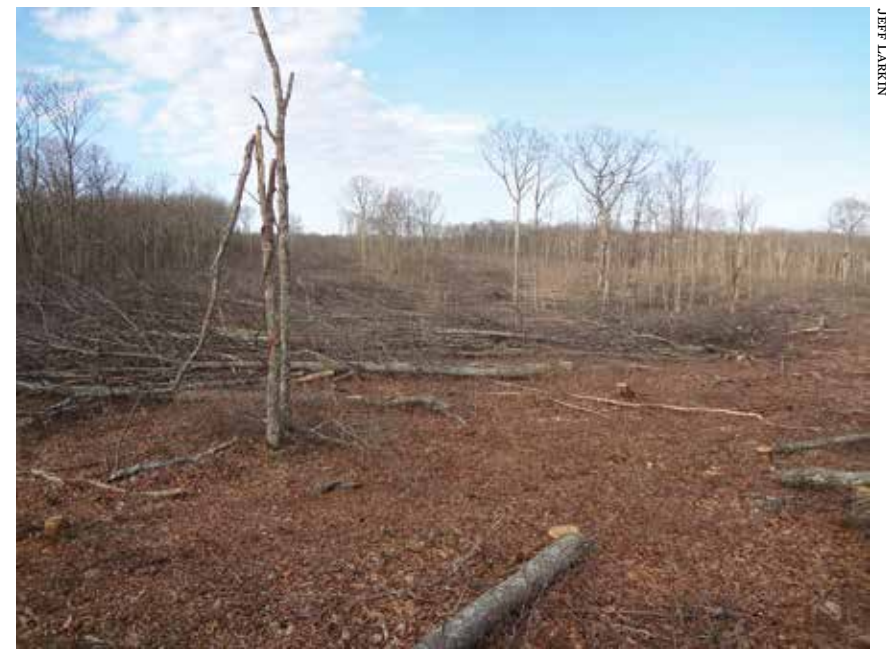
Figure 4. Retaining small groups of trees may reduce tree mortality from wind-throw.

Before and after harvest there are additional considerations for the manager including assessing the adequacy of the regeneration and light conditions, retaining seed sources, and controlling excessive deer browsing and undesirable competitive plants. Prescribed fire, brush-hogging, and additional treatments may enhance and extend the suitability of stands for Golden-winged Warbler.