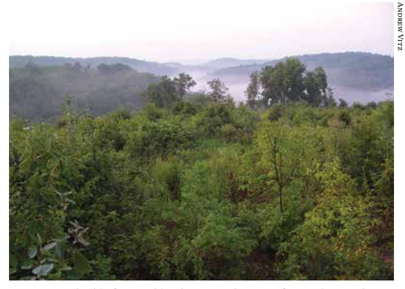
Figure 2. A highly forested landscape with young forest clustered throughout.

create a feathered edge that promotes gradual transition from young to mature forest