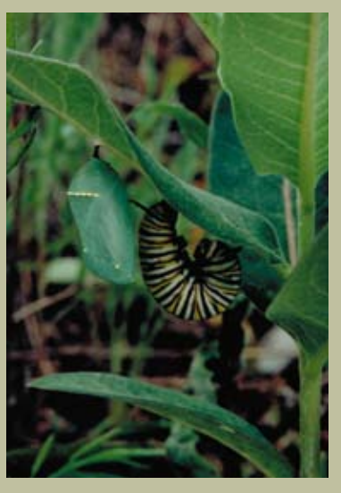
Gardening with native plants provides habitat for native birds and butterflies. Monarch larvae feed on milkweed.