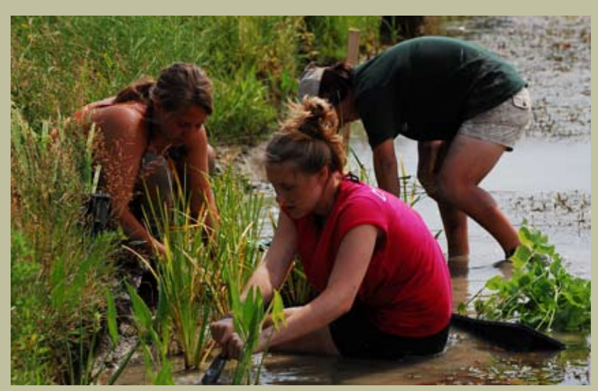
Chicago Wilderness applies the best science to restore and manage the region's natural areas, while engaging thousands of volunteers as stewards of the landscape.