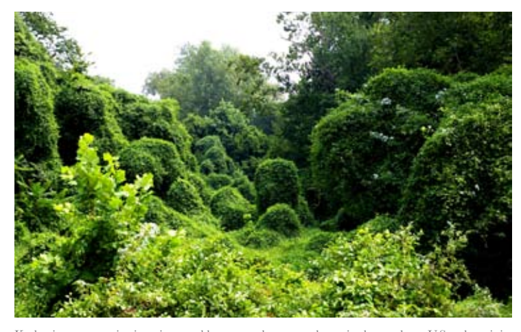
Kudzu is an aggressive invasive weed known as the green plague in the southern U.S., where it is nearly impossible to eradicate. Kudzu survival is limited by winter cold, but between 1971 and 2006 kudzu has moved north in Illinois from the far southern counties to Peoria. Warming temperatures will allow it to threaten additional land in northern Illinois.

These impacts to our natural areas affect our quality of life by limiting the benefits that we receive from healthy forests, prairies and wetlands. Millions of dollars in ecosystem benefits are lost every year to poorly planned growth. These losses are expected to increase as climate change continues.