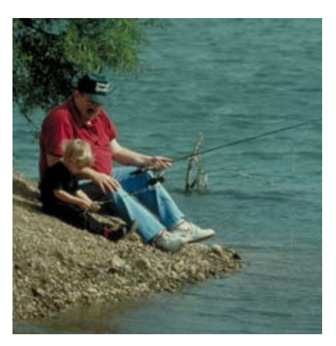
Nature offers many benefits, including opportunities for outdoor recreation, learning and discovery.

Residents of the Chicago Wilderness region are fortunate to have access to more than 370,000 acres of open space and natural areas that have been preserved as part of our growing metropolis. These natural areas offer many benefits, including opportunities for outdoor recreation, learning and discovery, and spiritual renewal. Healthy ecosystems also provide clean air and water, reduce pollution, help control flooding, and provide habitat for native wildlife.