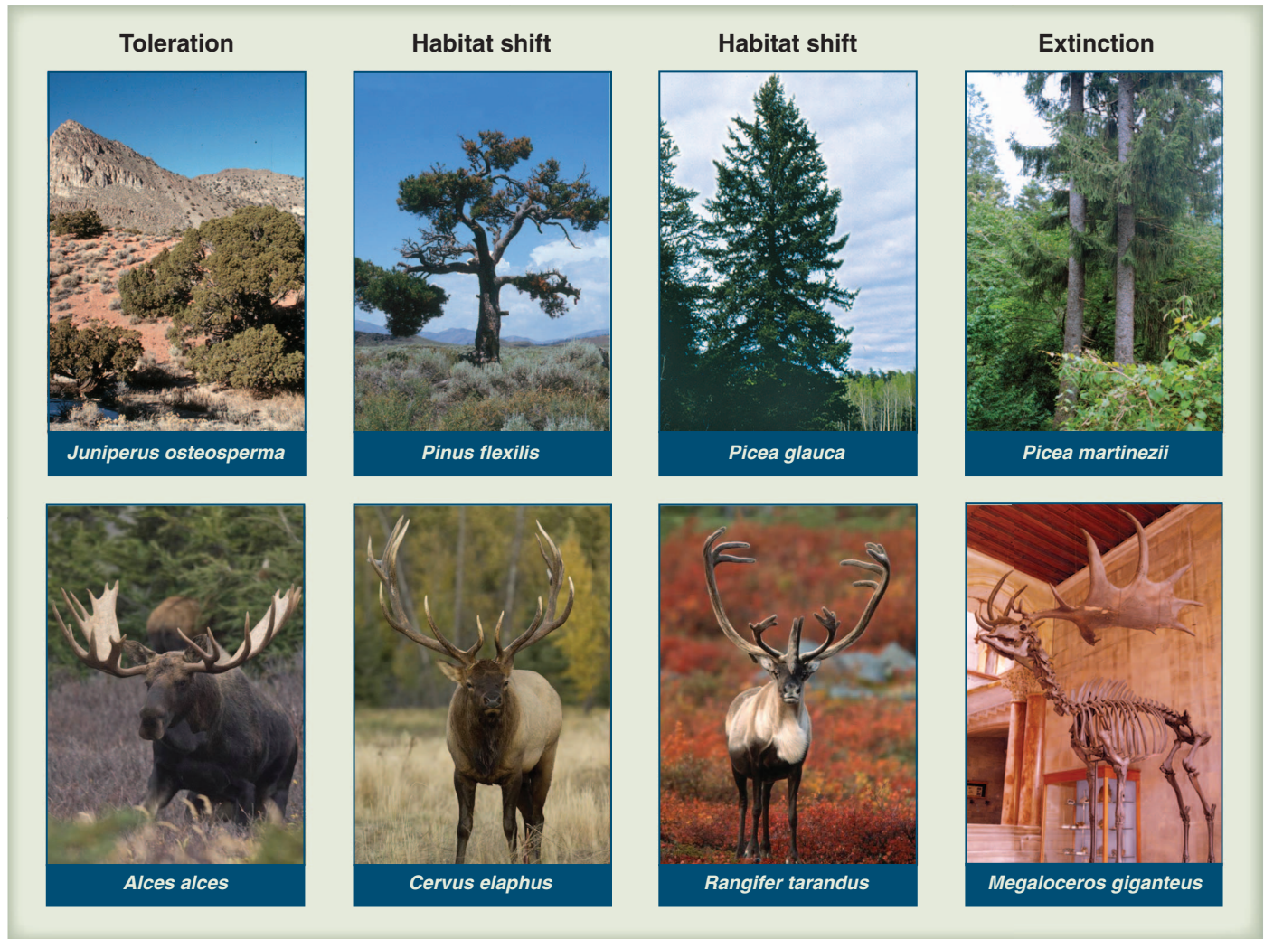
Fig. 2. Representative modes of population and species-range response to environmental changes since the last glacial maximum, documented for selected North American conifer trees and Eurasian cervids. Populations of many species have persisted in situ at individual sites since the last glacial maximum (toleration) and many have undergone habitat shifts, moving short distances (1 to 10 km) to sites with different aspects, slopes, elevations, and other attributes as the environment changed. Migrations of 100 to 1000 km are well documented for many species. Both migration and habitat shift are forms of environment tracking, in which species adjust their geographic locations to track suitable environments. At least a few species have undergone universal extinction (e.g., Megaloceros giganteus ) owing to environmental change; others have experienced loss of genetic diversity, usually associated with severe population bottlenecks (near-extinction episodes) (e.g., Picea martinezii ). Species' responses to climate change may consist of multiple

Intrinsic adaptive capacity for climate change. Observations, experiments, and mechanistic models indicate that many species populations have the capacity to adjust to climate change in situ via phenotypic plasticity (e.g., acclimation, acclimatization, developmental adjustments) (Fig. 2) (35, 39) and microevolution (40, 41), and that many populations are able to disperse locally to suitable microhabitats (42, 43) or regionally to